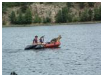
Dog Team on Water Search

TO REQUEST A TEAM FROM SARDOC CALL 970-416-1985 For more contact information see page 2