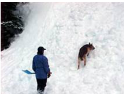
An avalanche dog team practices searching a debris field for a buried subject.