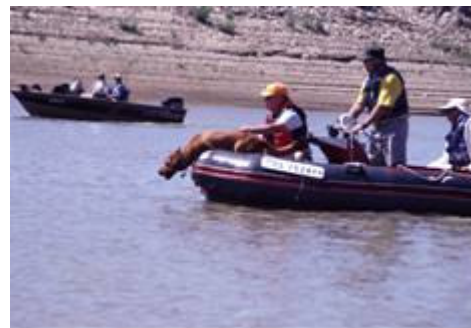
An air scent dog looking for a diver's scent while practicing water search techniques in Pueblo.