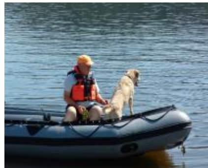
I'm Kiowa, a certified air scent and water search dog. We live in Colorado Springs, CO.