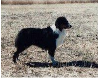
Dundee - responsible for two "finds" in three months