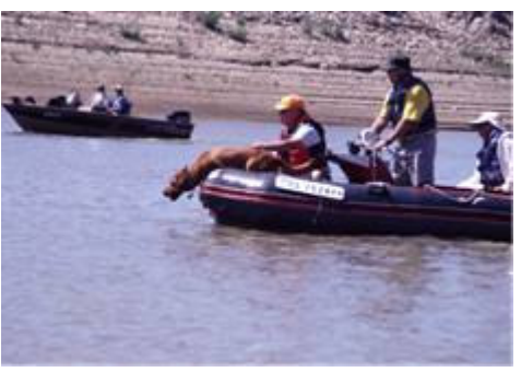
An air scent dog looking for a diver's scent while practicing water search techniques in Pueblo.