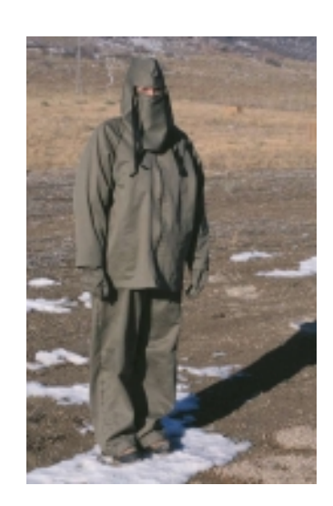
Subject wearing an odoradsorbing suit. Subjects wore the jacket, pants, gloves, breath mask, and hood.

I initiated this study for a few reasons: 1) to improve my knowledge of search dog capability, 2) because studying the