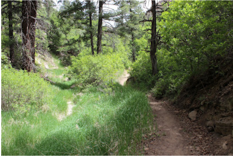
Sample view of Canyon bottom. Most of canyon is not this lush. Next picture is overview of area.